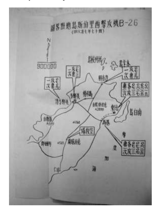
Figure 1—A sketch map of the Nationalist B-26 dropping and bombing on Indonesia July 26, 1958.

It also captured an American pilot carrying a US$10000 recruitment contract and permits of American bases.<sup>34</sup> Finally, the Indonesian campaign ended when the anti-Sukarno rebels lost beyond all repair.