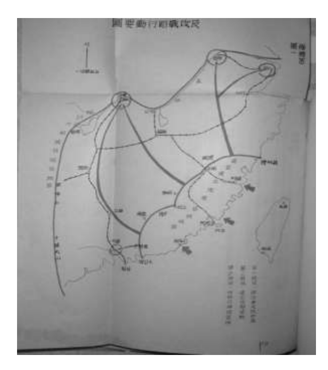
Figure 3—A sketch map of the Nationalist 24-month counter-attack war plan in 1963.